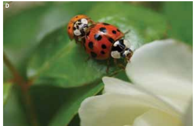
The life stages of the invasive ladybird, Harmonia axyridis . The eggs (A) take 3-4 days to hatch once they are laid. Ladybirds stay in the larval stage (B) for around 3 weeks, after which they form a pupa (C). Adults emerge from their pupae 4-5 days later, and take around a week to become mature adults (D). Research on the thermal adaptation of the invasive ladybird Harmonia axyridis includes several life stages A. eggs, B. larva, C. pupa and D. adults, in order to make reliable predictions of its responses to climate change.