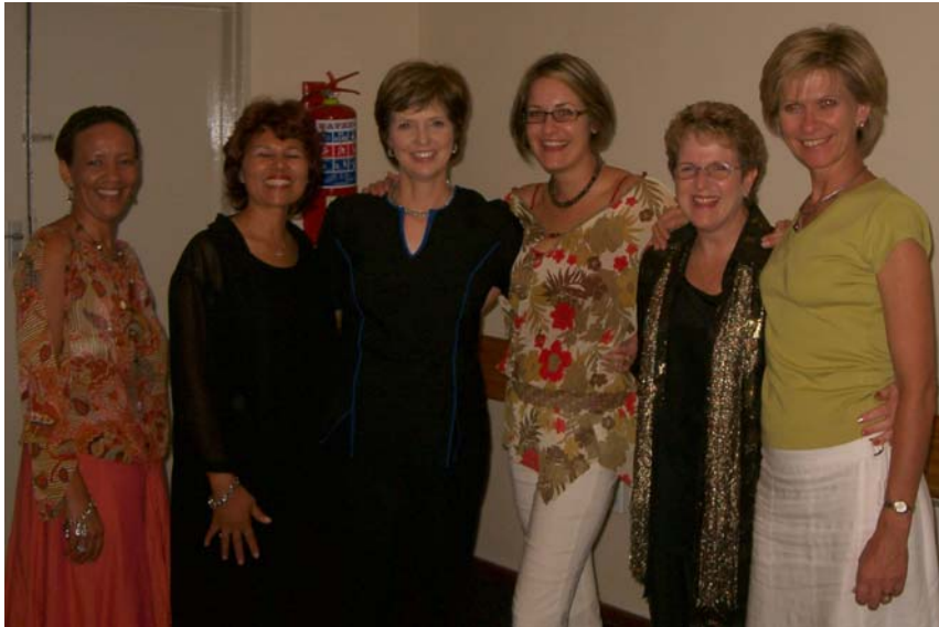
SANPAD LADIES – ENJOYING THE EVENING OF THE INAUGURAL LECTURE