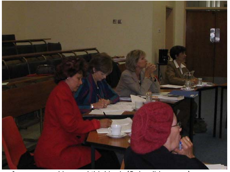
Girl power at its best – I can still smell the fresh aroma of women working and thinking! (Splendid aroma.)