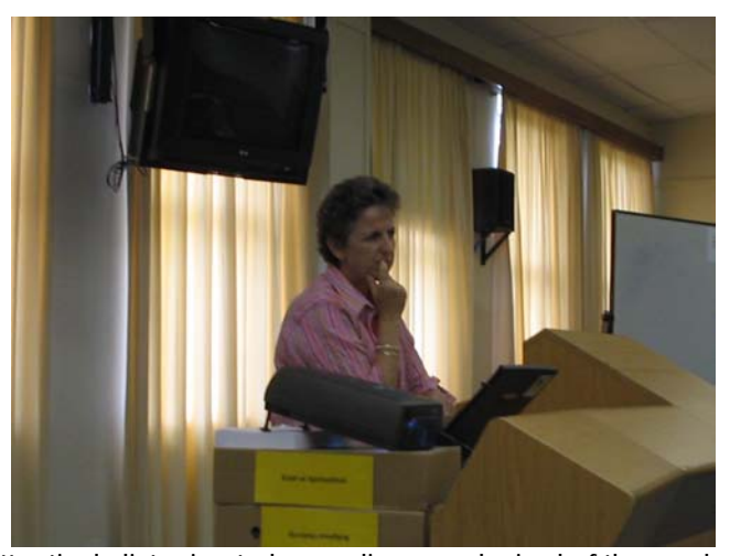
Another pink lady attentively listening to her audience – desired of those who preach dialogue!!!