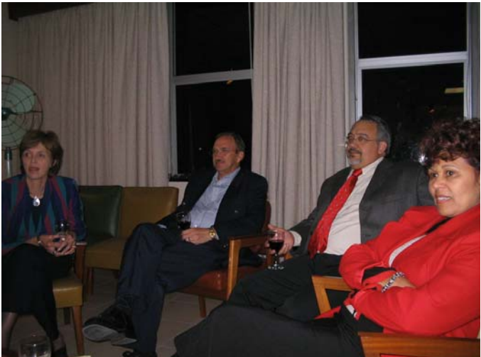
Guess who are married for more than 25 years (PS check the colour-coding...)